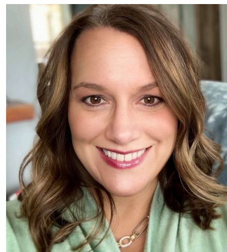
QUEEN'S COURT OF SALES ACHIEVER!