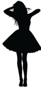
PAMELA BRESST Diamond