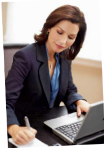
You are your own boss. We teach you to work Mary Kay into your current lifestyle.